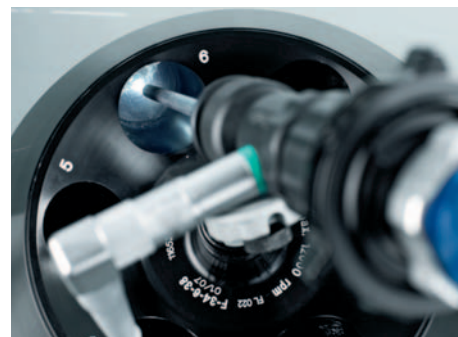
Corrosion of bore hole